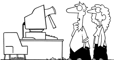
"Somebody broke into your computer, but it looks like the work of an inexperienced hacker."