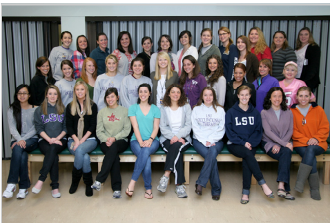
OT Class of 2013

The School of Allied Health Professions (SAHP) welcomes 2 new classes for the Spring of 2011: the Clinical Laboratory Sciences Class of 2012 and the Occupational Therapy Class of 2013. Thirty-one students in the Clinical Laboratory Science program and thirty-four students from the Occupational Therapy program attended orientation on January 10th. The Occupational Therapy program received 93 applications for the Class of 2013 and the CLS department received 43 applications for the Class of 2012. The School of Allied Health Professions continues to grow with 440 students registered for the Spring 2011 semester. This is an increase of 9% from Spring 2010.