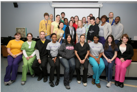
CLS Class of 2012