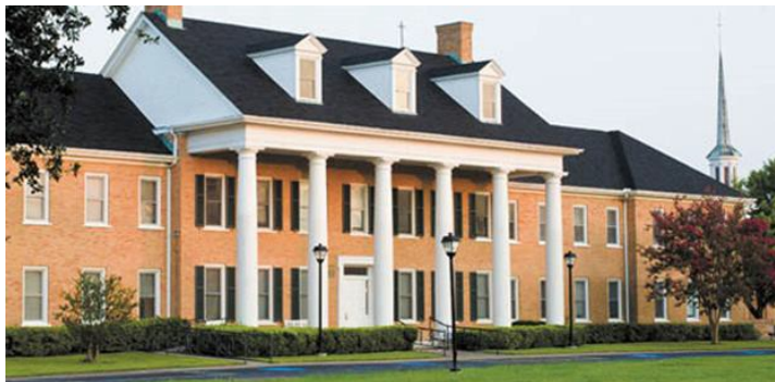
University of Holy Cross